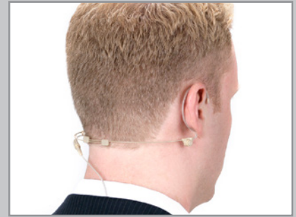
Double ear design