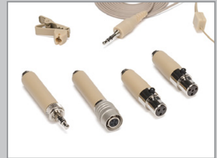
Includes four different transmitter adapters