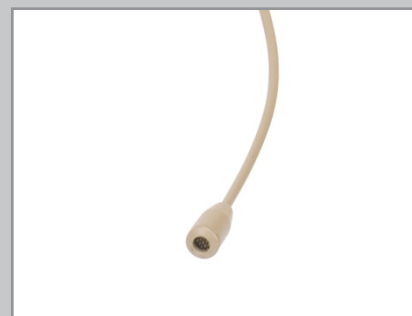
Micro-miniature (2.5mm) condenser capsule