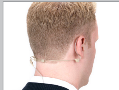
Double ear design