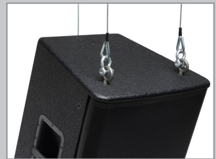
Twelve M10 fly points