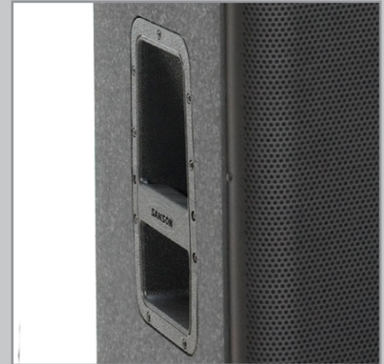
Integrated carry handles