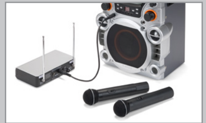
KARAOKE (1/4-inch to 1/4-inch cable)