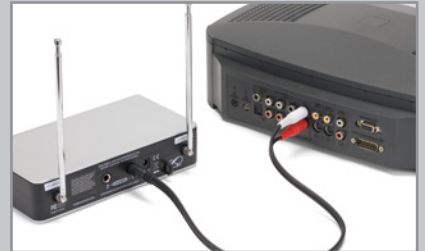
HOME STEREO (1/4-inch to RCA cable)