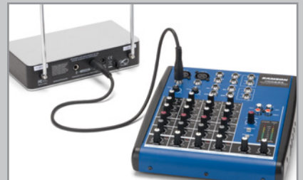
LIVE SOUND (1/4-inch to 1/4-inch cable)