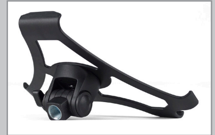
Mic stand thread